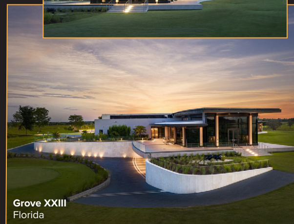
Grove XXIII Florida